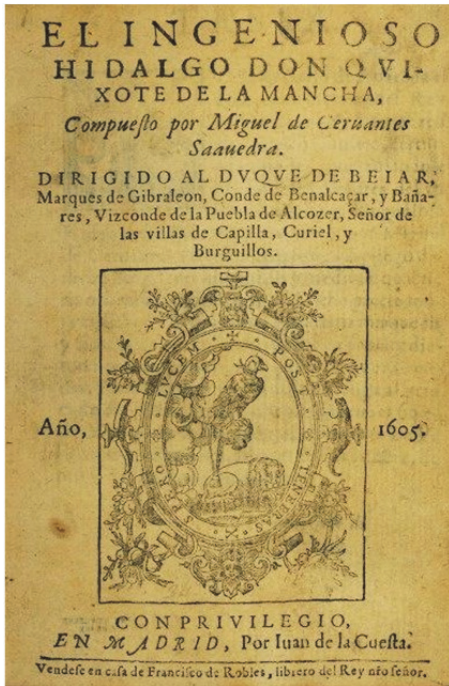
Case Y 722 .C344

A Joint Cervantes/Early Modern Studies Symposium on the occasion of the 400th anniversary of their shared death date in April 1616